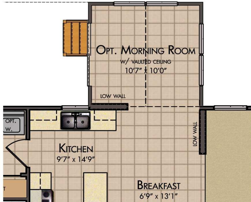
Add the Morning Room with vaulted ceiling.