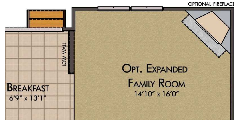
Add an additional 2 feet to expand your Family Room.